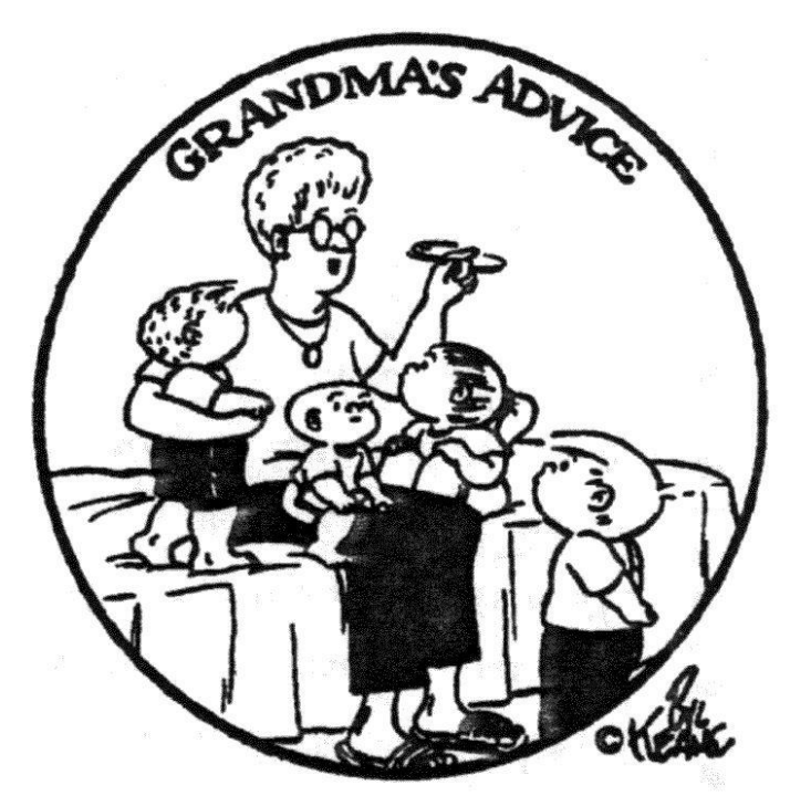
"If you're ever headed the wrong way in life, remember the road to Heaven allows U-turns."

Respect your parents – they passed school without google