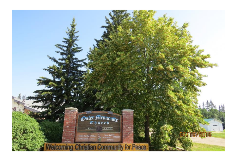
Photo #3: The 20 year old Molotschna Oak tree reminds us of part of out history.

Photo #2 The oldest tree on the OMC yard, a Manitoba Maple, shows off its gnarled trunk